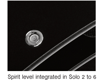
Spirit level integrated in 3010 2 to 6